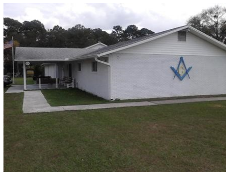
Groveland ~ Mascotte